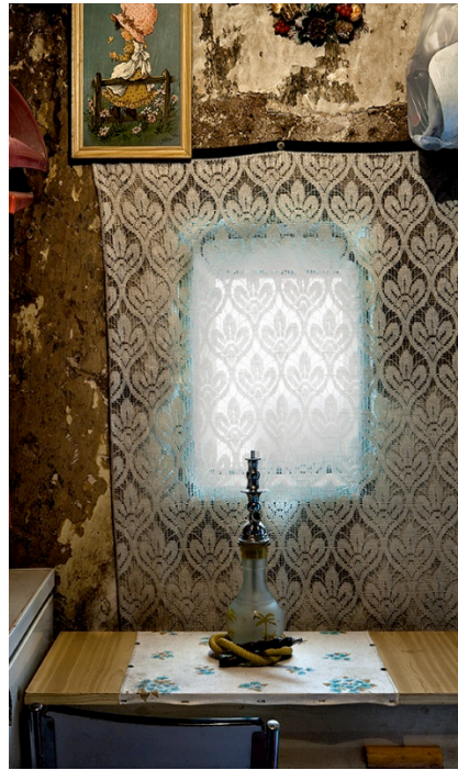
Ángel Marcos , The intimate Subversion, 2013

Photographs Installation/mixed media, 5.75'x13.12'x9.84